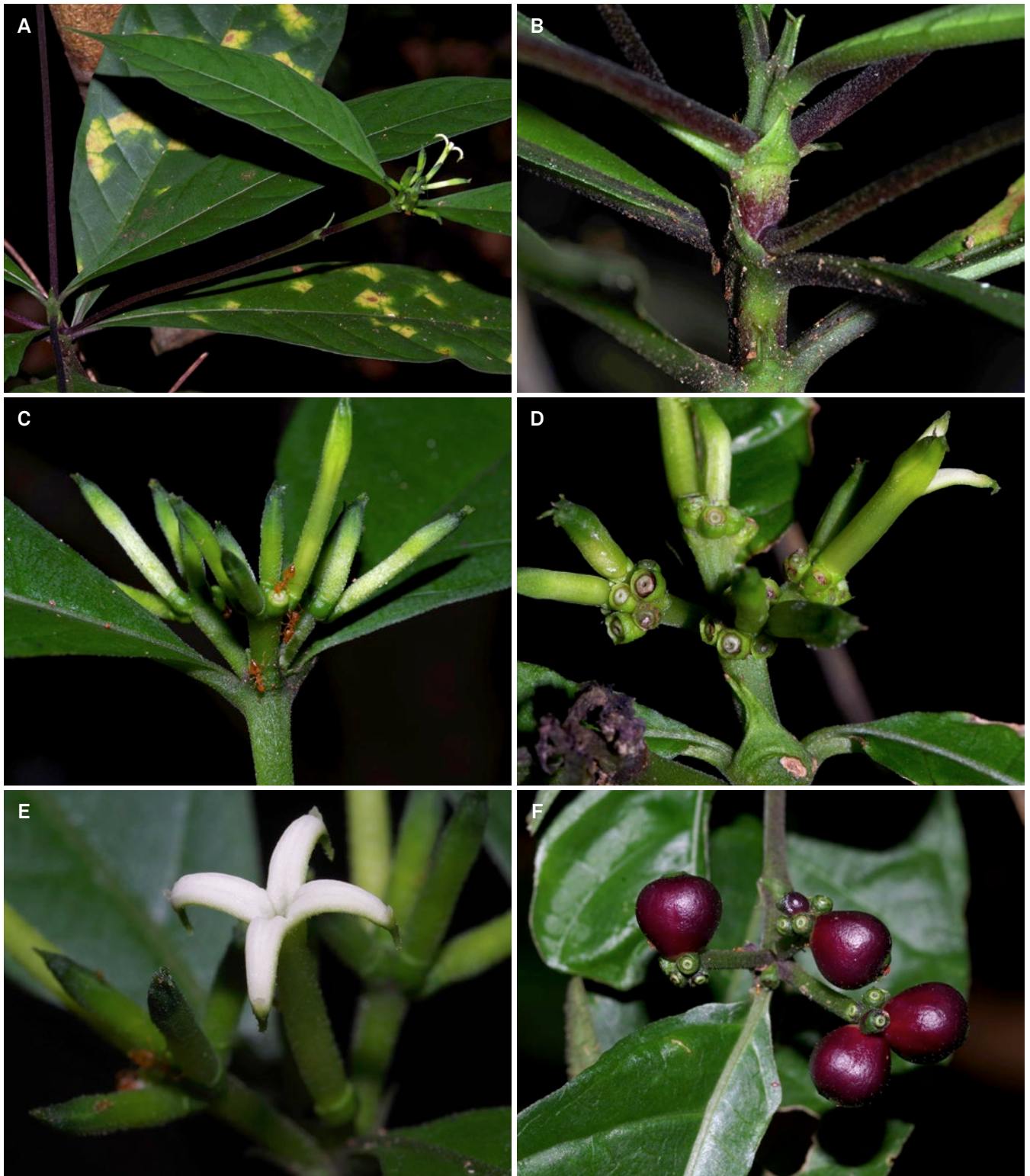
Fig. 3. – Appunia morindoides (A. Rich.) Delprete, C.M. Taylor & T. McDowell. A. Branchlet with inflorescence; B. Stem closeup, showing distalmost nodes with stipules; C. Inflorescence with flower buds, being visited by small ants; D. Inflorescence with most corollas fallen off, showing calyx limbs and disks; E. Open flower (note corolla lobes with apical appendices, both galeate adaxial appendages and abaxial corniform appendages); F. Inflorescence with ripe fruits. [A–C, E: trail to Savane-Roche Corail, Kourou, French Guiana; D: trail Grand Boeuf Mort, Saül, French Guiana; F: Montagne des Singes, French Guiana]