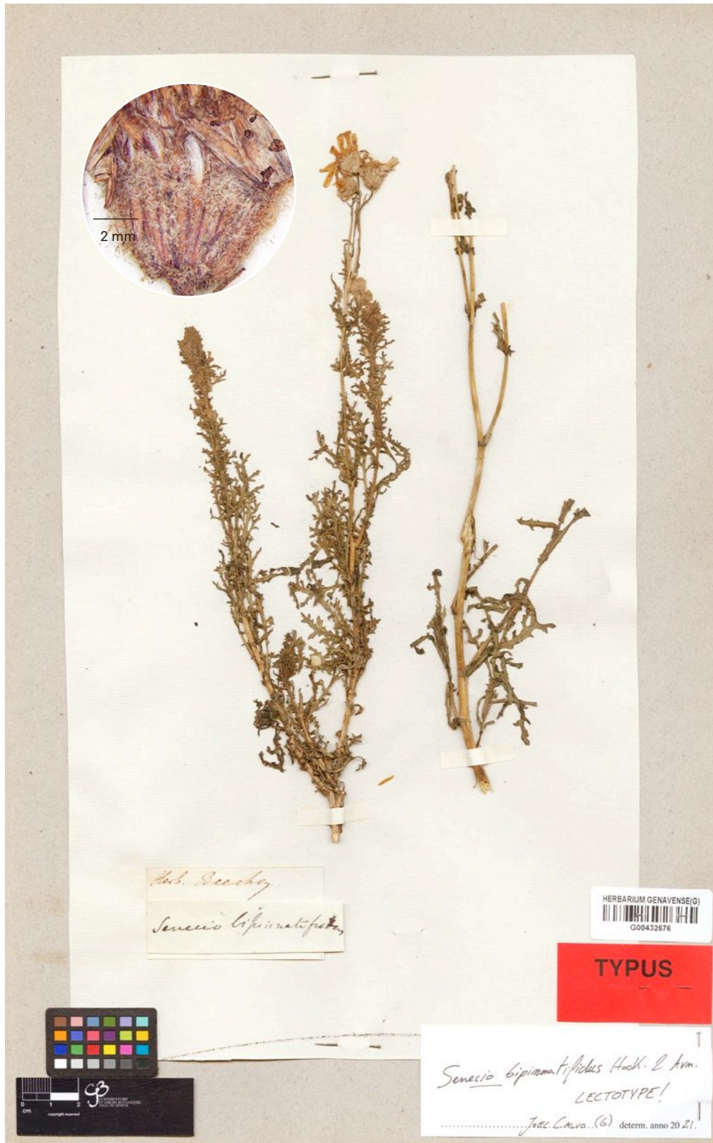
Fig. 1. – Lectotype of Senecio bipinnatifidus Hook. & Arn. [G00432676; Conservatoire et Jardin botaniques de Genève]