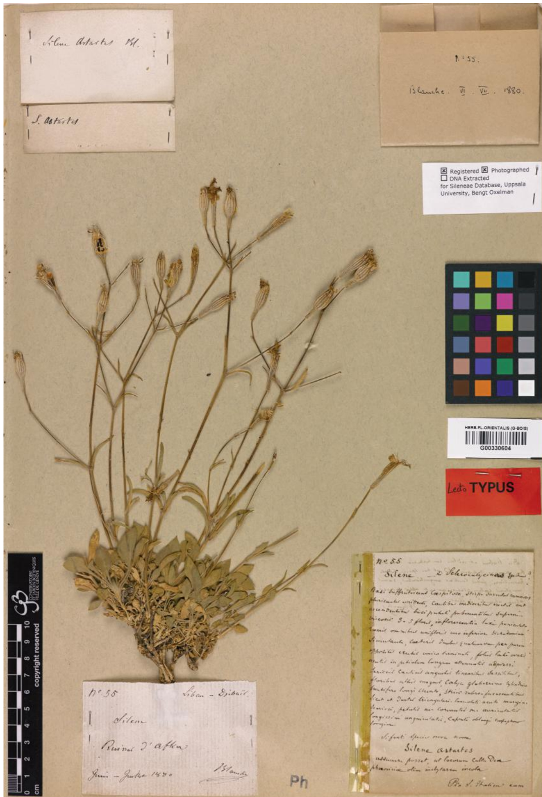
Fig. 1. – Lectotype of Silene astartes C.I. Blanche ex Boiss. The morphological description is written by C.I. Blanche at the bottom right of the herbarium sheet. [Blanche 55, G-BOIS]