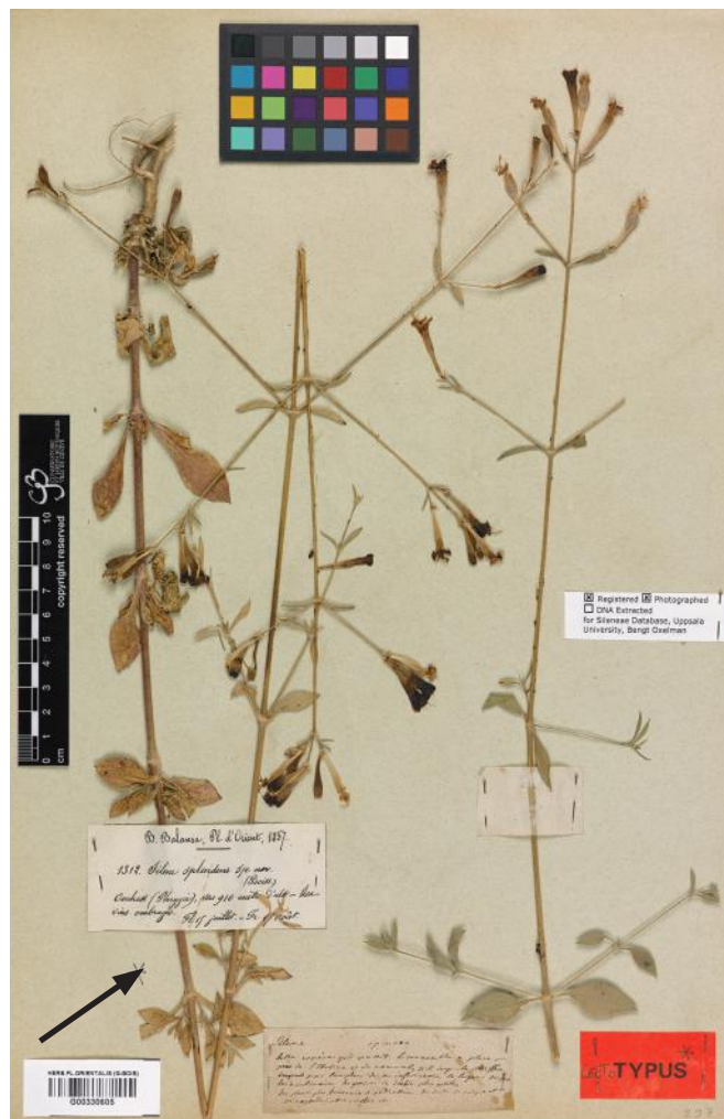
Fig. 3. – Lectotype of Silene splendens Boiss. (designated by an arrow). [Balansa 1312, G-BOIS]

the morphology of this species by designating a single plant as lectotype. We therefore designate the single specimen in G-BOIS mounted on the second sheet as lectotype because it is the most complete specimen and the determination bears Boissier's handwriting (Fig. 2). The two other specimens in G-BOIS are therefore considered as isolectotypes as the remaining duplicates distributed in various herbaria.