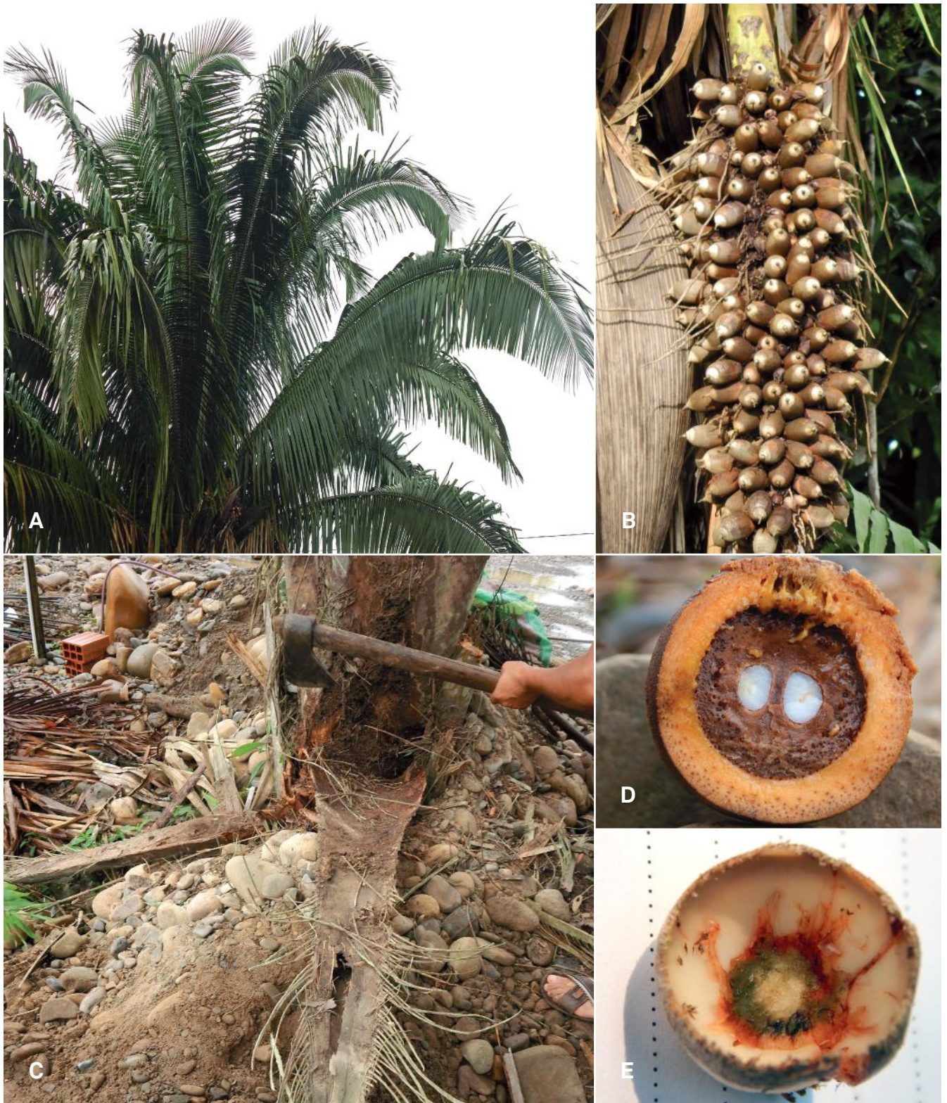
Fig. 2. – Attalea blepharopus Mart. A. Growth habit; B. Infructescence at ripe stage; C. Fibrous margins of leaf base; D. Cross section of fruit showing two developing seeds; E. Staminal ring adnate to corolla (removed from a fruit) appears densely ciliate in the margins.