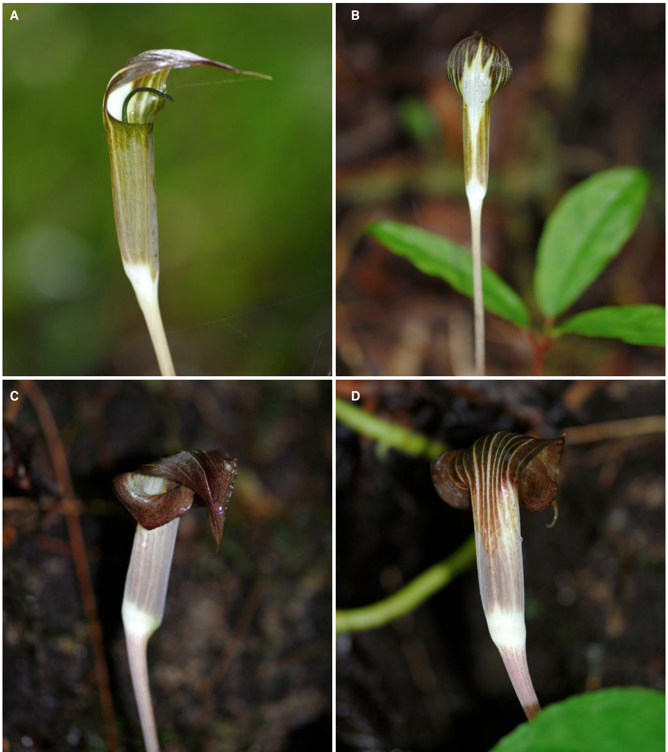
Fig. 2. – Inflorescences of Arisaema brinchangense Y.W. Low, Scherberich & Gusman ( A-B ) and A. anomalum Hemsl. ( C-D ). A. Side view of the inflorescence showing straight and hardly recurved spathe-tube mouth margin; B. Dorsal view of the inflorescence showing distinct white to pale cream coloured trident marking (with three pointed tips) on the spathe-limb; C. Side view of an inflorescence showing strongly recurved (auriculate) spathe-tube mouth margin; D. Dorsal view of the inflorescence showing white to pale cream coloured narrow parallel stripes along the spathe-limb.