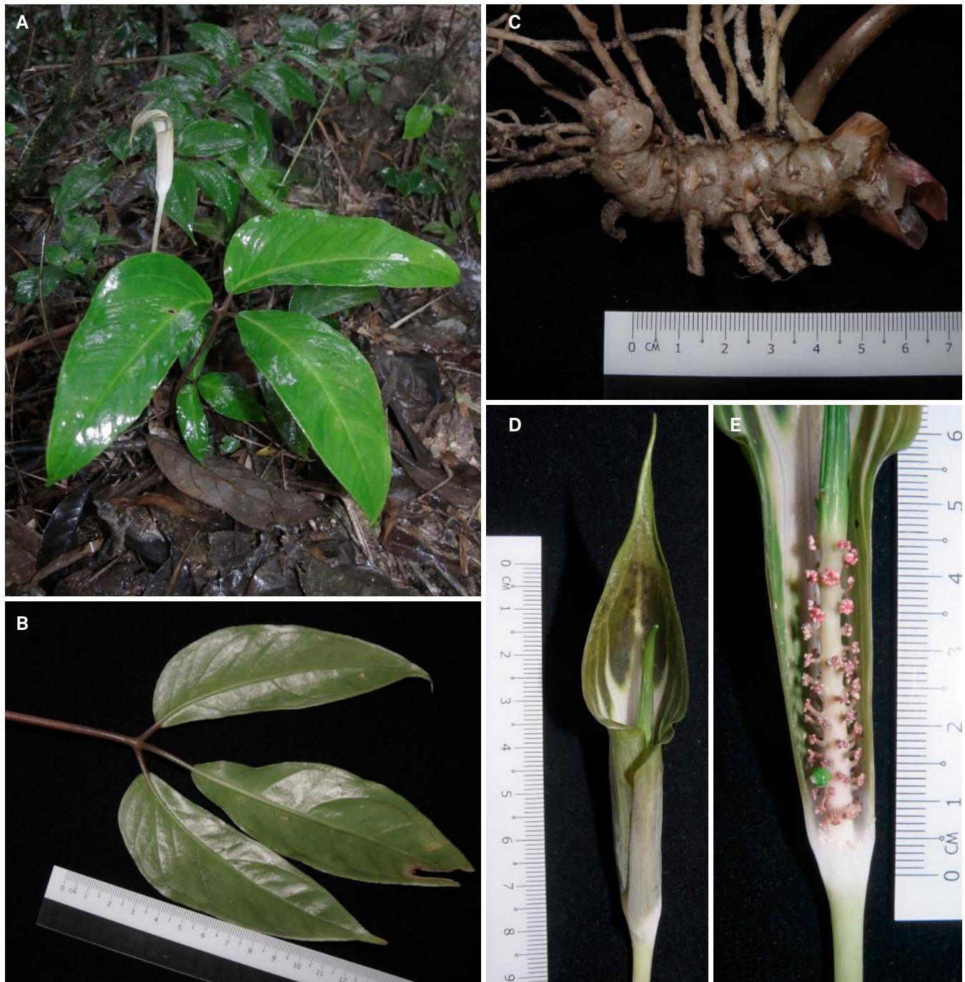
Fig. 1. – Arisaema brinchangense Y.W. Low, Scherberich & Gusman. A. Habit; B. Details of the lower leaf blade surface; C. Rhizome showing numerous offsets and fleshy white roots, inflorescence artificially removed; D. Front view of an inflorescence showing spathe-limb with distinctive white trident marking (with three pointed tips) and spadix-appendix slight bent forward; E. Spathe-tube of a male inflorescence artificially removed to show the male spadix fertile zone, note pollen accumulated at the base of the tube.

[Low & Low-Edwin LYW 520, SING]